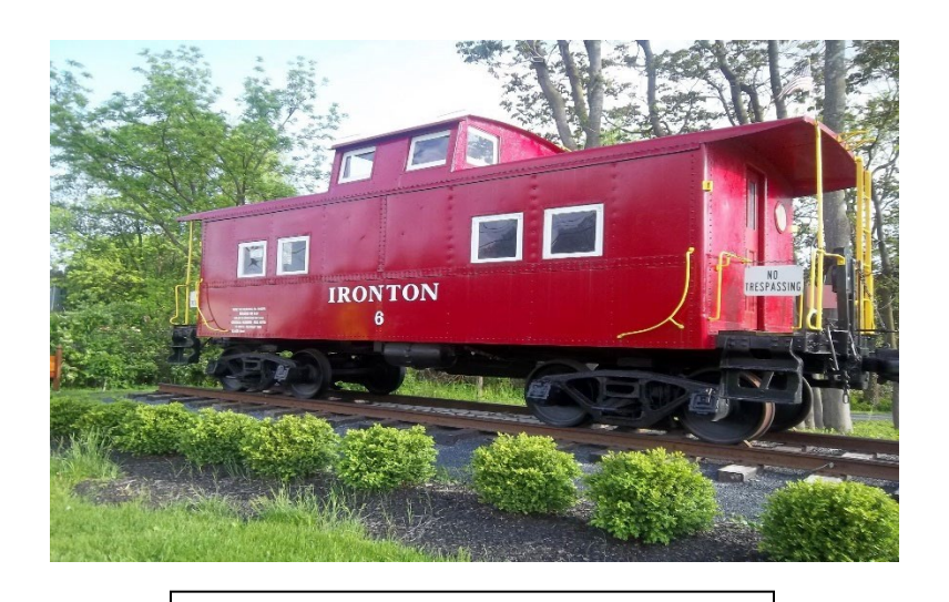
Ironton Rail Trail