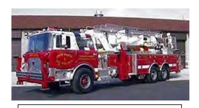
Local Fire Department